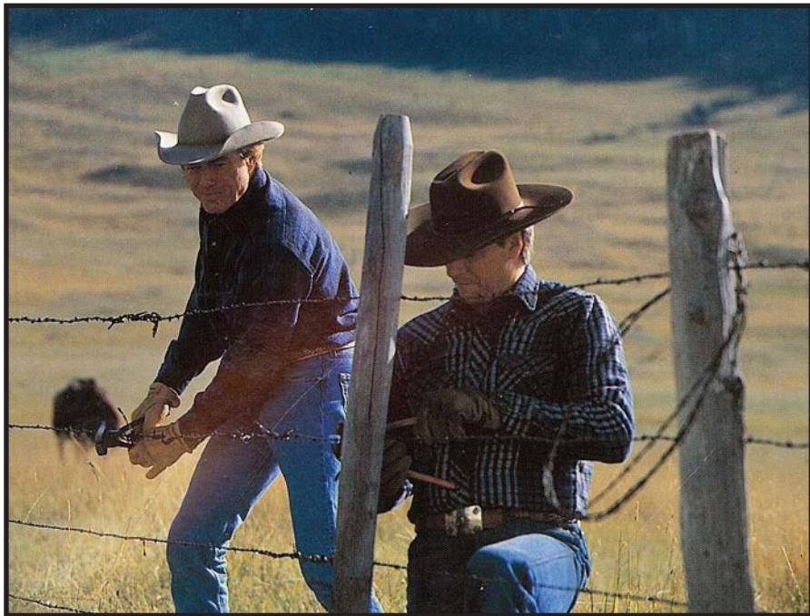
CUTLINE FOR LEFT AND RIGHT PAGE