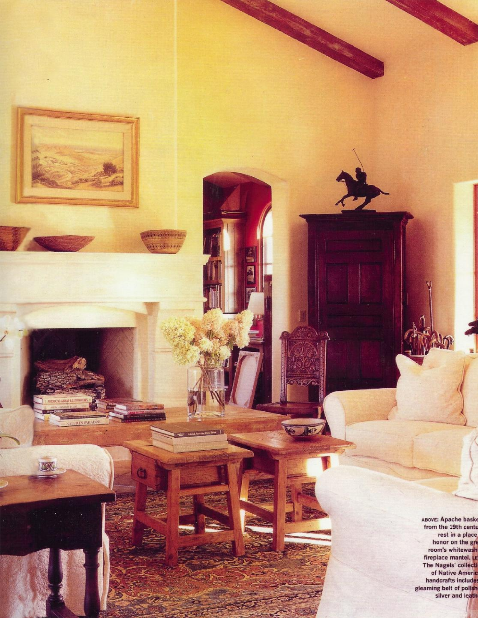
ABOVE: Apache baskets from the 19th century rest in a place of honor on the grey room's whitewashed fireplace mantel. LEFT: The Nagels' collection of Native American handcrafts includes a gleaming belt of polished silver and leather.